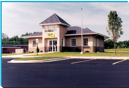
Neighborhood Branch with Tower Vestibule