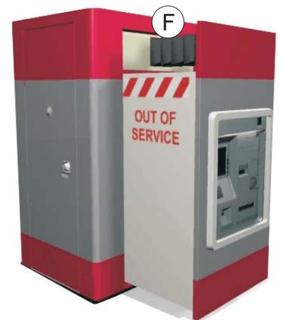
ATM in Out of Service Position