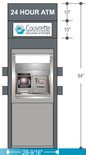
CUSTOM WALK-UP SURROUND FRONT ELEVATION