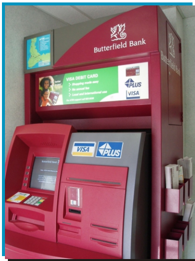
Custom Walk-up Surround with Integrated Literature Holder