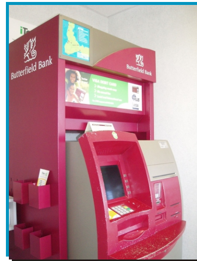
Custom Walk-up Surround with Integrated Literature Holder

ATMs shown are for illustrative purposes. See Couvrette's ATM Cross-reference Guide for a complete listing of all ATM models compatible with this product.