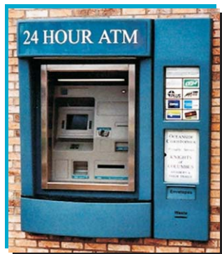
Walk-up Surround with POS Panel