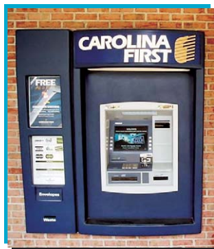
Walk-up Surround with POS Panel