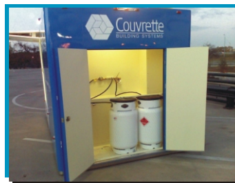
Rear Access Propane Tanks