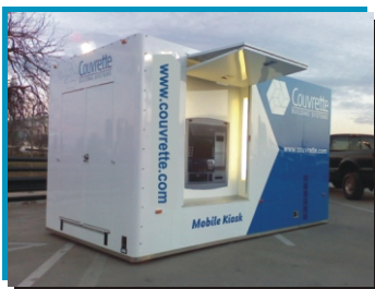
Operational Position, ATM Side

Security Lights Four (4) High Output Security Flood Lights