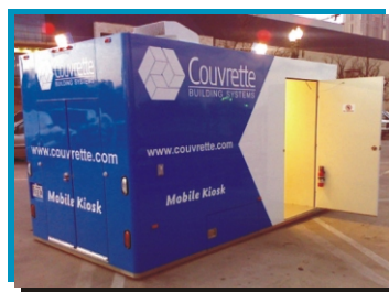
Service Room Access Door