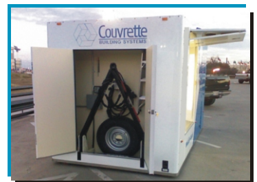
Front Access Towing Tongue

ATMs shown are for illustrative purposes. The Mobile ATM Kiosk is designed to accommodate most ATMs. Contact Couvrette Building Systems for more information.