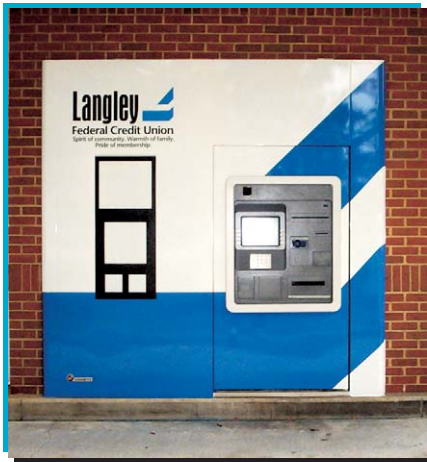
First Lane Surround with POS Panel