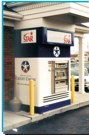
First Lane Surround with Backlit Signcan