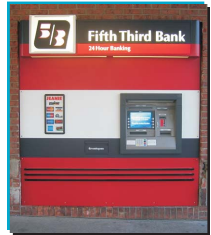
First Lane Surround with Backlit Signcan

ATMs shown are for illustrative purposes. See Couvrette's ATM Cross-reference Guide for a complete listing of all ATM models compatible with this product.